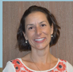
Mrs. Parental Fourth Grade PM